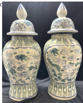
Pr Hand Painted Ceramic Asian Floor Urns... ASIAN CERAMIC GROUP