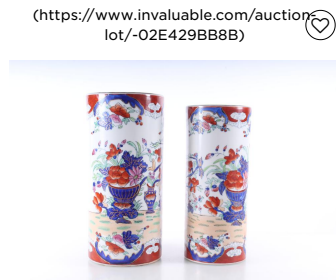
Asian Vases Lot Of Two